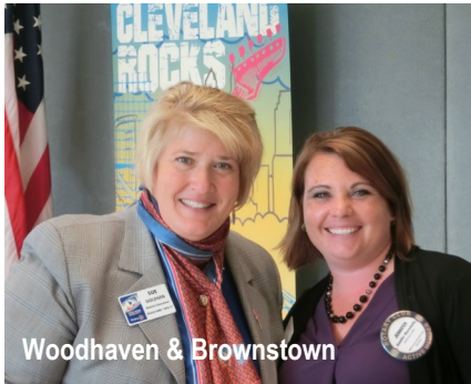
Woodhaven & Brownstown