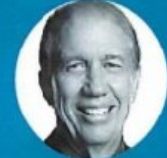
Jim Loehr, Ed. D. Bestselling Author and World-Renowned Performance Psychologist