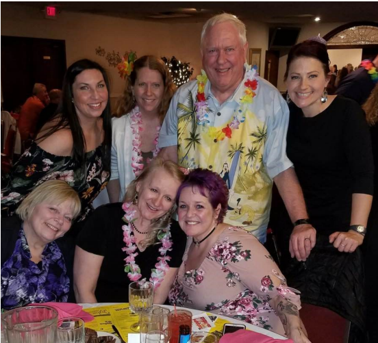
(Above) Dearborn Heights Rotarians had a great time during their Polynesian Paradise dinner April 14th.

(Below) At an April meeting, Dearborn Rotary celebrated the award of 25 college scholarships to students from Dearborn schools.