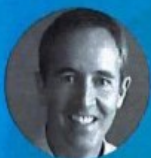
Andy Stanley Leadership Communicator and Bestselling Author