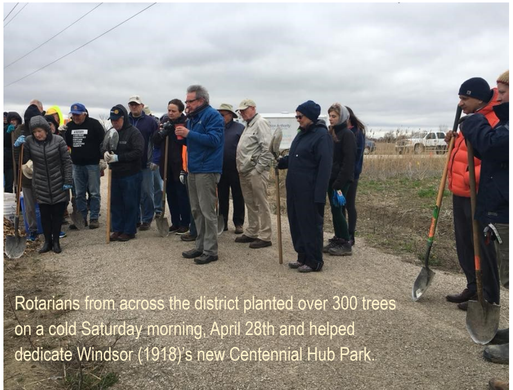
Rotarians from across the district planted over 300 trees on a cold Saturday morning, April 28th and helped dedicate Windsor (1918)'s new Centennial Hub Park.