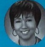
Mae Jemison NASA Astronaut, Engineer & Physician