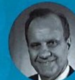
Joe Torre Hall of Fame Baseball Manager